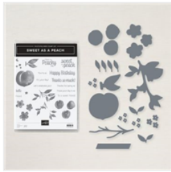
Sweet As A Peach Bundle (English) - 155823

Linda Bartolucci www.inkstampandscrap.com/shop linda@inkstampandscrap.com www.inkstampandscrap.com