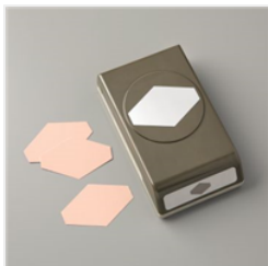
Tailored Tag Punch - 145667