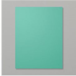
Just Jade 8-1/2" X 11" Cardstock - 153079