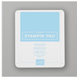
Balmy Blue Classic Stampin' Pad - 147105