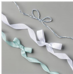
Flowers For Every Season Ribbon Combo Pack - 153620