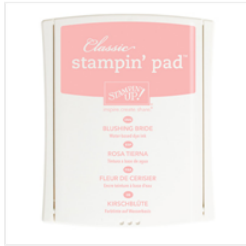
Blushing Bride Classic Stampin' Pad - 131172