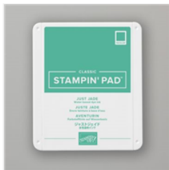
Just Jade Classic Stampin' Pad - 153115