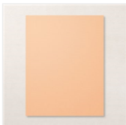
Pale Papaya 8-1/2" X 11" Cardstock - 155668