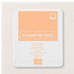
Pale Papaya Classic Stampin' Pad - 155670