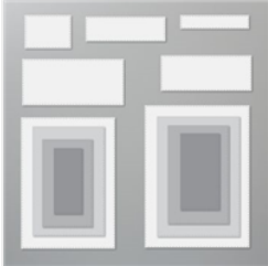
Rectangle Stitched Dies - 151820