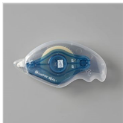
Stampin' Seal+ - 149699