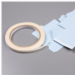
Tear & Tape Adhesive - 138995