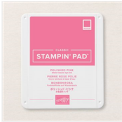
Polished Pink Classic Stampin' Pad - 155712