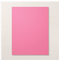
Polished Pink 8-1/2" X 11" Cardstock - 155710