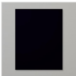
Basic Black 8-1/2" X 11" Cardstock - 121045