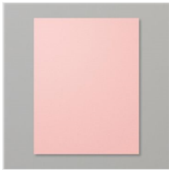
Blushing Bride 8-1/2" X 11" Cardstock - 131198