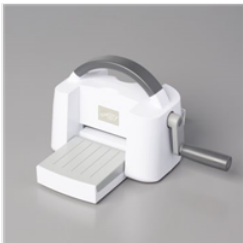
Mini Stampin' Cut & Emboss Machine - 150673