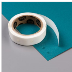
Mini Glue Dots - 103683