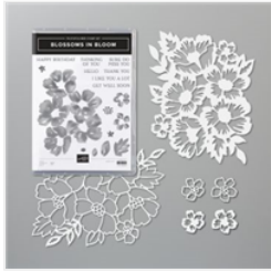
Blossoms In Bloom Bundle (English) - 159526

Linda Bartolucci www.inkstampandscrap.com/shop linda@inkstampandscrap.com www.inkstampandscrap.com