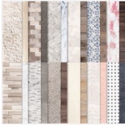
In Good Taste Designer Series Paper - 152494