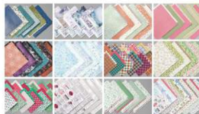
August - December Mini Catalog