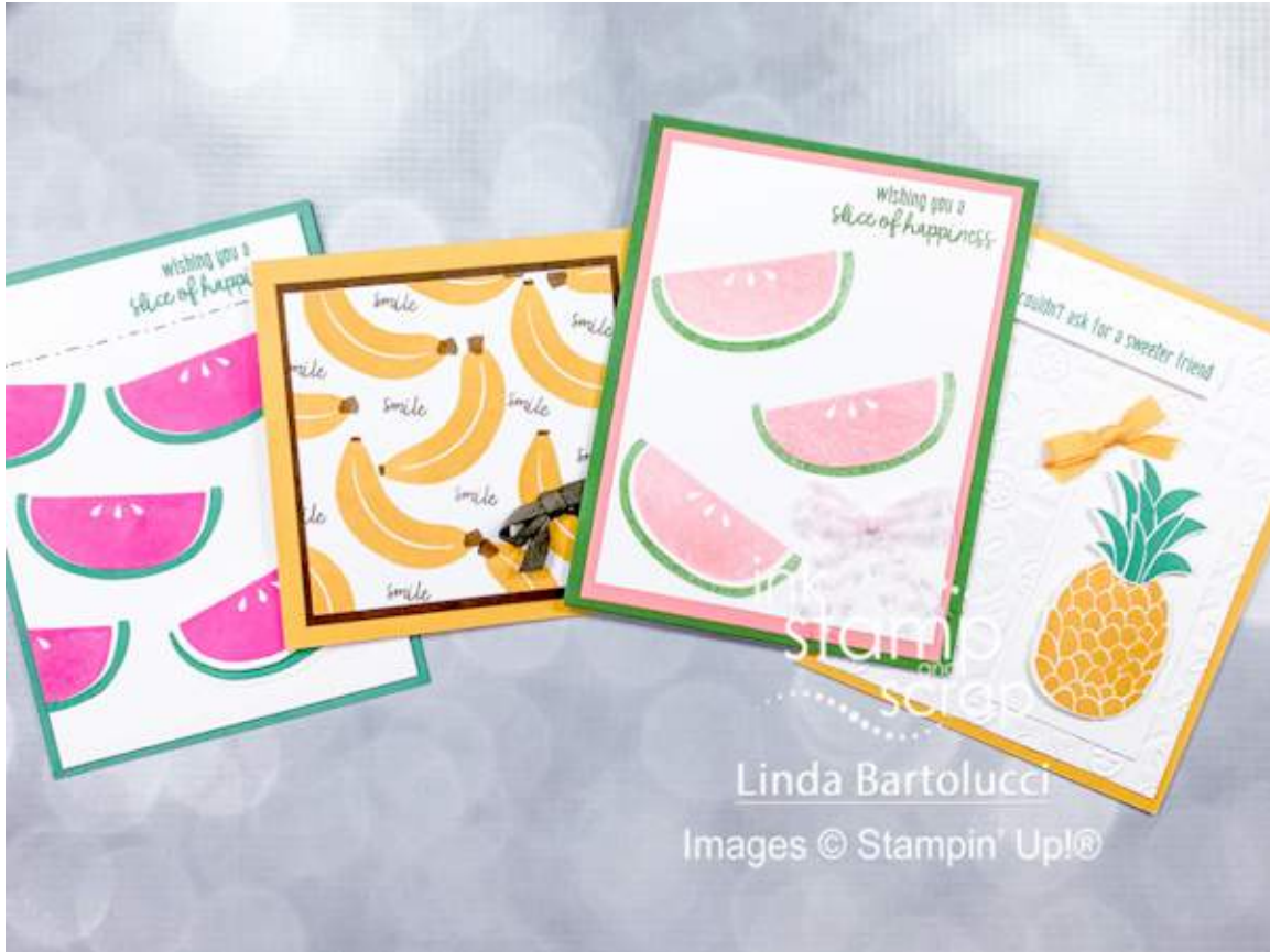
Linda Bartolucci

Shop for products to make these cards at: http://inkstampandscrap.com/shop